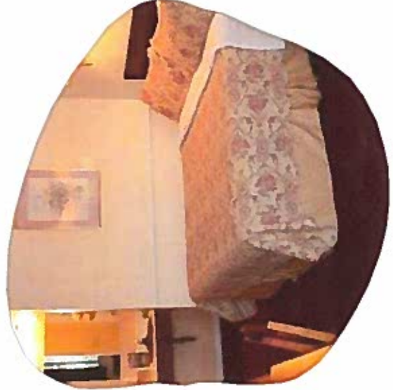
Overnight Housing in local motels